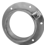
SLF RS BG™ buis