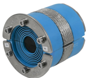
RS BG™ afdichting